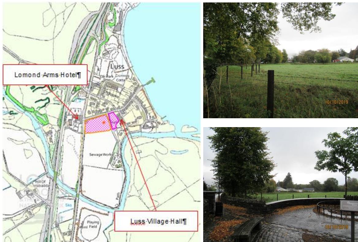
Figure 3: Luss Village Green (photographs of the site from the Memorial Oak and as viewed from old Luss Road (old A82) looking east).