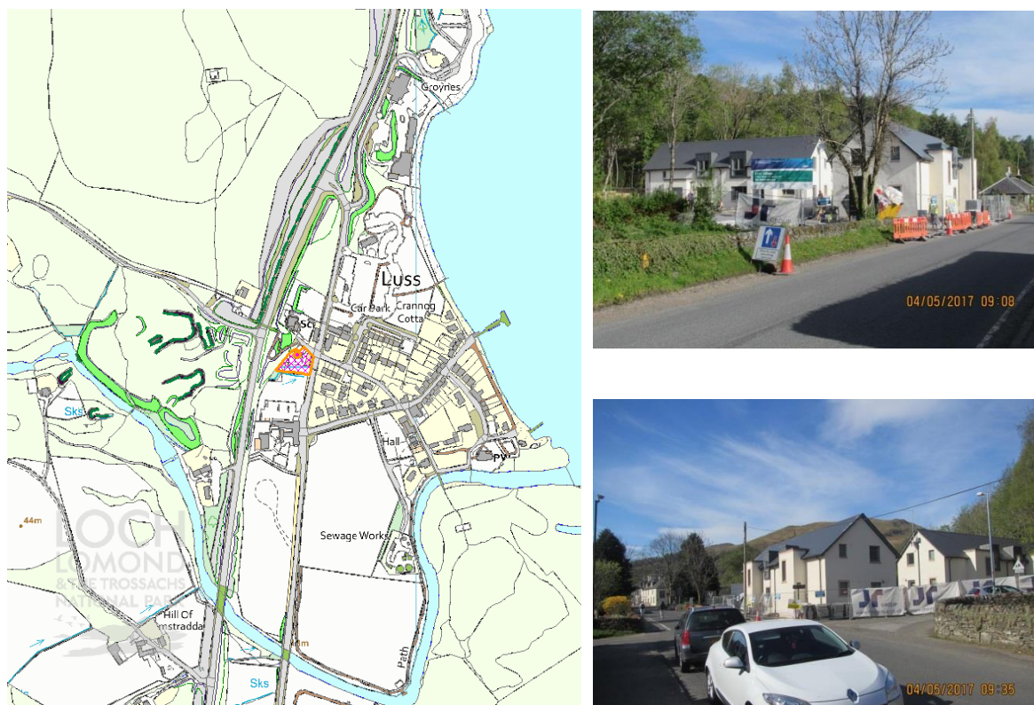
Figure 4: Link Housing Group - 5 Affordable Houses (site location and nearing completion in 2017)