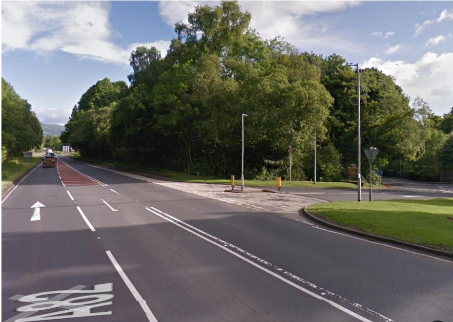
Plate 6: Photo of turning off A82 towards Cameron House main access

3.5 The current principal access for Cameron House resort traffic is positioned 1.3km to the north-west of the south access and is accessed by a ‘ghost island’ priority junction off the A82 Trunk Road. Access to the resort is then via an approx. 5.5m wide carriageway between gate piers (as shown in plate 6 & 7 below).