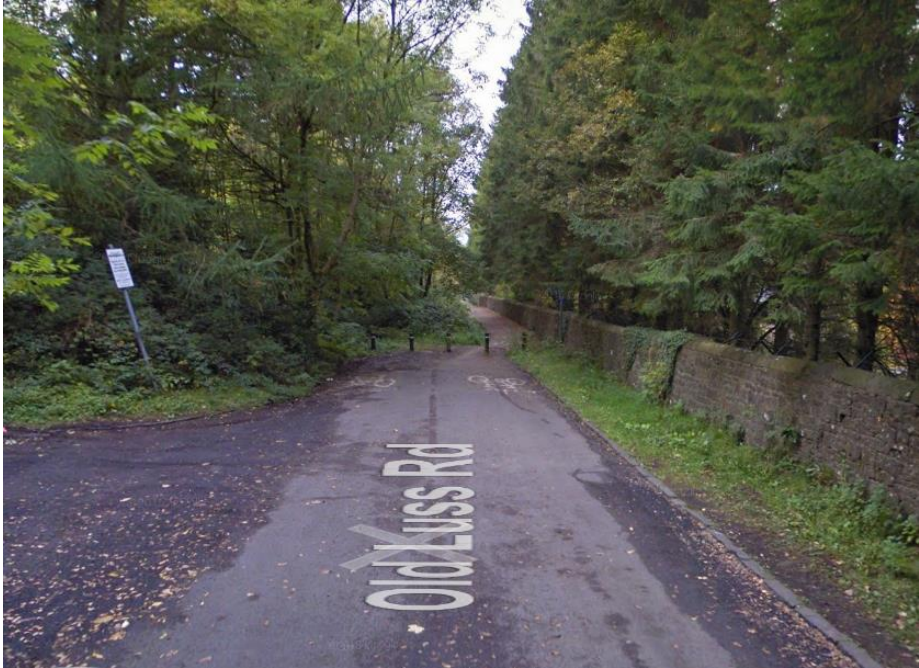
Plate 5: Northern termination of Old Luss Road as a public road.

3.5 The current principal access for Cameron House resort traffic is positioned 1.3km to the north-west of the south access and is accessed by a ‘ghost island’ priority junction off the A82 Trunk Road. Access to the resort is then via an approx. 5.5m wide carriageway between gate piers (as shown in plate 6 & 7 below).