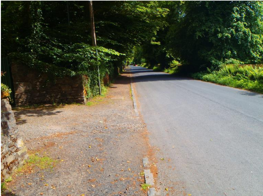
Plate 3: Photo showing example of pavement surface at Old Luss Road looking south