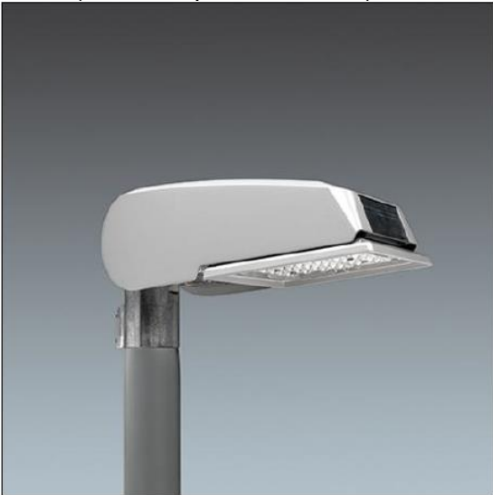
Plate 12. Lighting lantern proposed