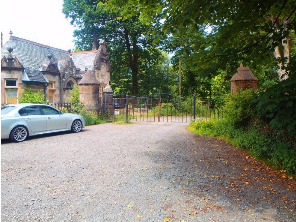
Plate 1: Photo of South Access at junction with Old Luss Road and showing the South Lodge (South Lodge in separate ownership)

3.4 Old Luss Road is a public road. It terminates approx. 1km to the north of the South Lodge (with no through route for cars) at which point it becomes a footpath/cycle path leading north to Duck Bay and West Lochlomondside. Old Luss Road is designated as a core path being both a regional (West Loch Lomond) cycle route and forming part of the long distance John Muir and Three Lochs Ways.