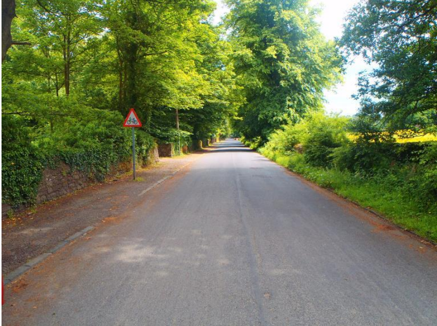
Plate 2: Photo of Old Luss Road looking south towards Balloch

3.4 Old Luss Road is a public road. It terminates approx. 1km to the north of the South Lodge (with no through route for cars) at which point it becomes a footpath/cycle path leading north to Duck Bay and West Lochlomondside. Old Luss Road is designated as a core path being both a regional (West Loch Lomond) cycle route and forming part of the long distance John Muir and Three Lochs Ways.