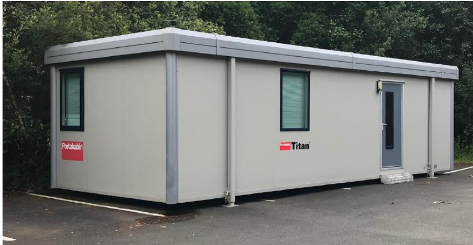
Plate 13. Portacabin proposed