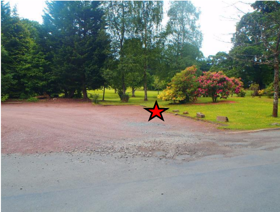
Plate 10 & 11 (above): Photo of car park area and site for proposed temporary reception (highlighted with red star above)