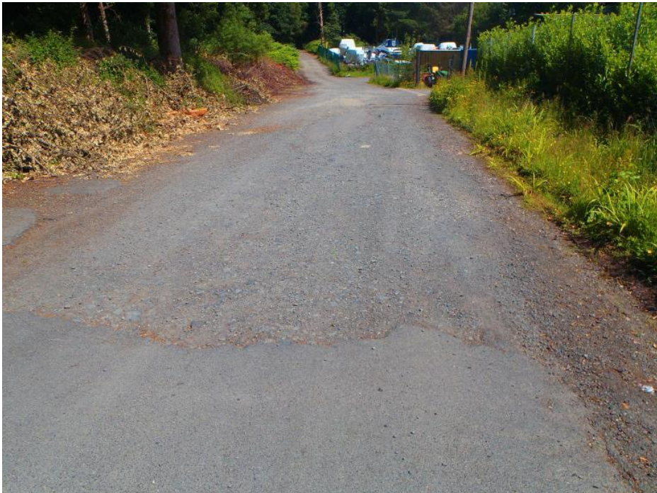
Plate 8: Photo of existing south access road through Cameron House Hotel resort

3.6 The internal access road included in the application site routes from the South Access through the resort. The access road has a mixed surface, being predominantly tarmac but with sections of an un-finished stone surface. The access road is partially lighted with street lighting.