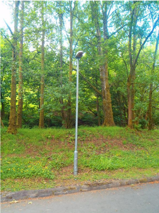
Plate 9: Photo of existing lighting column

3.7 The application site terminates at a car park within the grounds which is currently used for business use primarily relating to the Boathouse Restaurant, Marina and Golf Course.