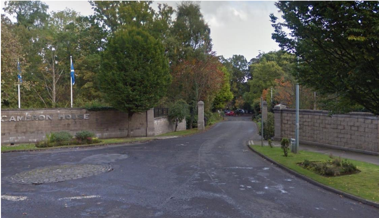
Plate 7: Photo of existing Main Access to Cameron House Hotel resort

3.6 The internal access road included in the application site routes from the South Access through the resort. The access road has a mixed surface, being predominantly tarmac but with sections of an un-finished stone surface. The access road is partially lighted with street lighting.