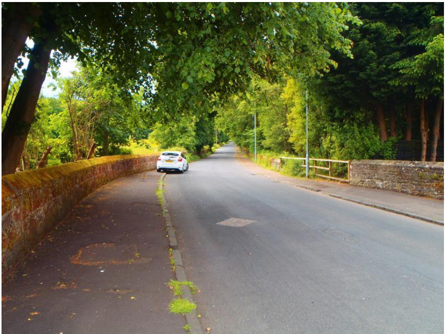
Plate 4: Photo of Old Luss Road looking north, at edge of urban housing extent