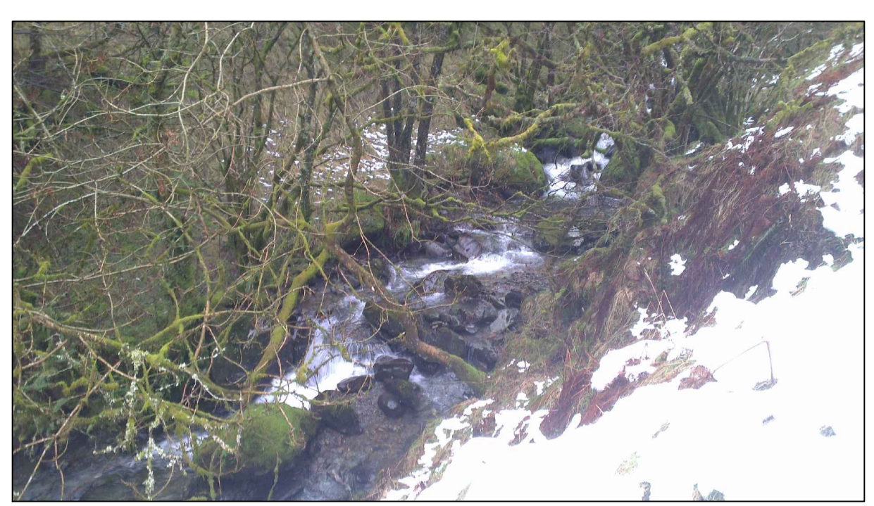
B Photo B