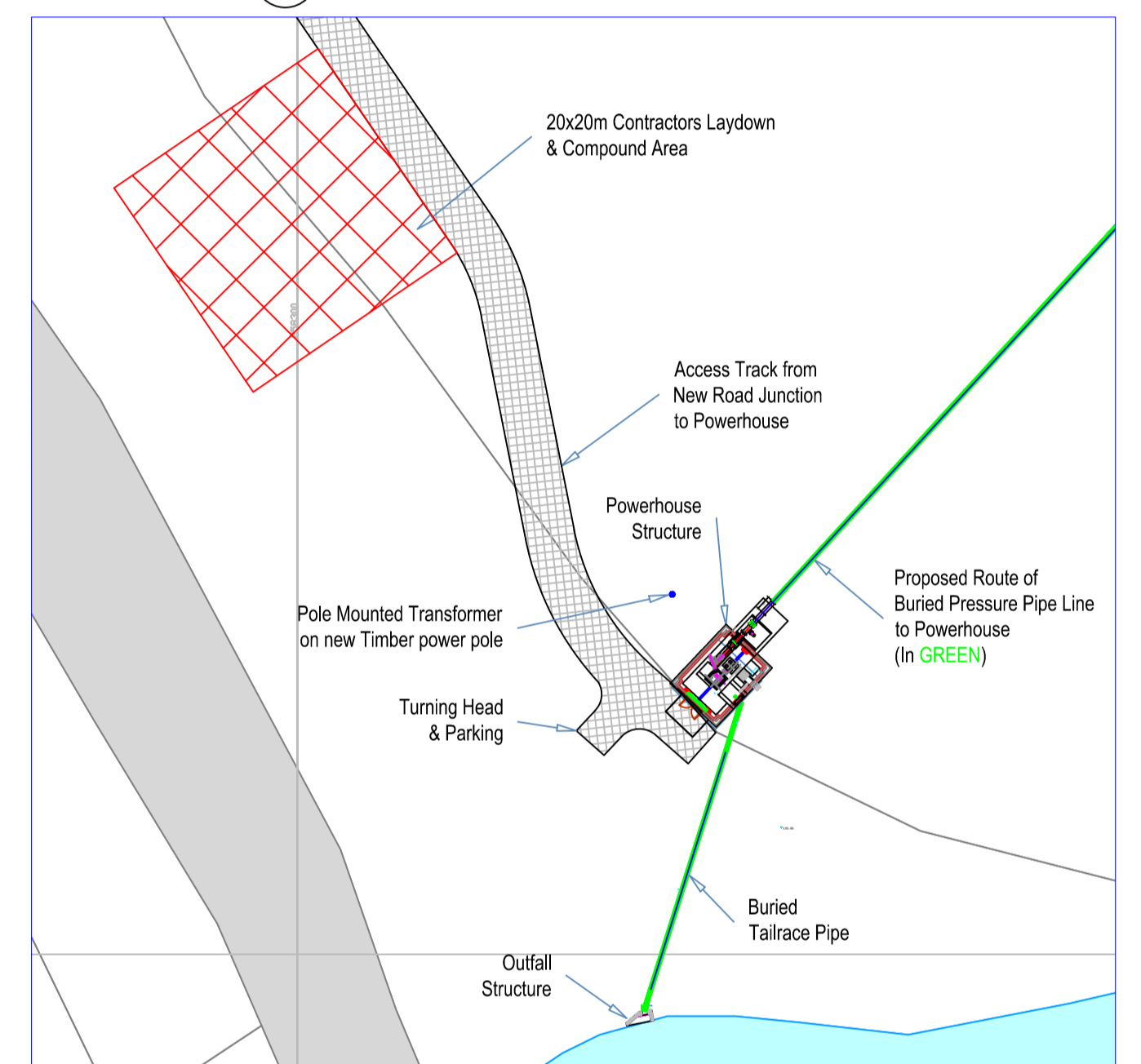
4 PLAN AT POWER HOUSE/OUTFALL Scale: 1:500

B:- 7x10m Temp Hardstanding/Tracks Clarified 24.11.14 REVISION: A:- Construction Boundary Added DATE: 21.07.14