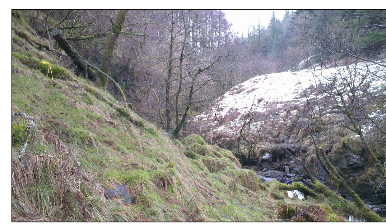
A Photo A