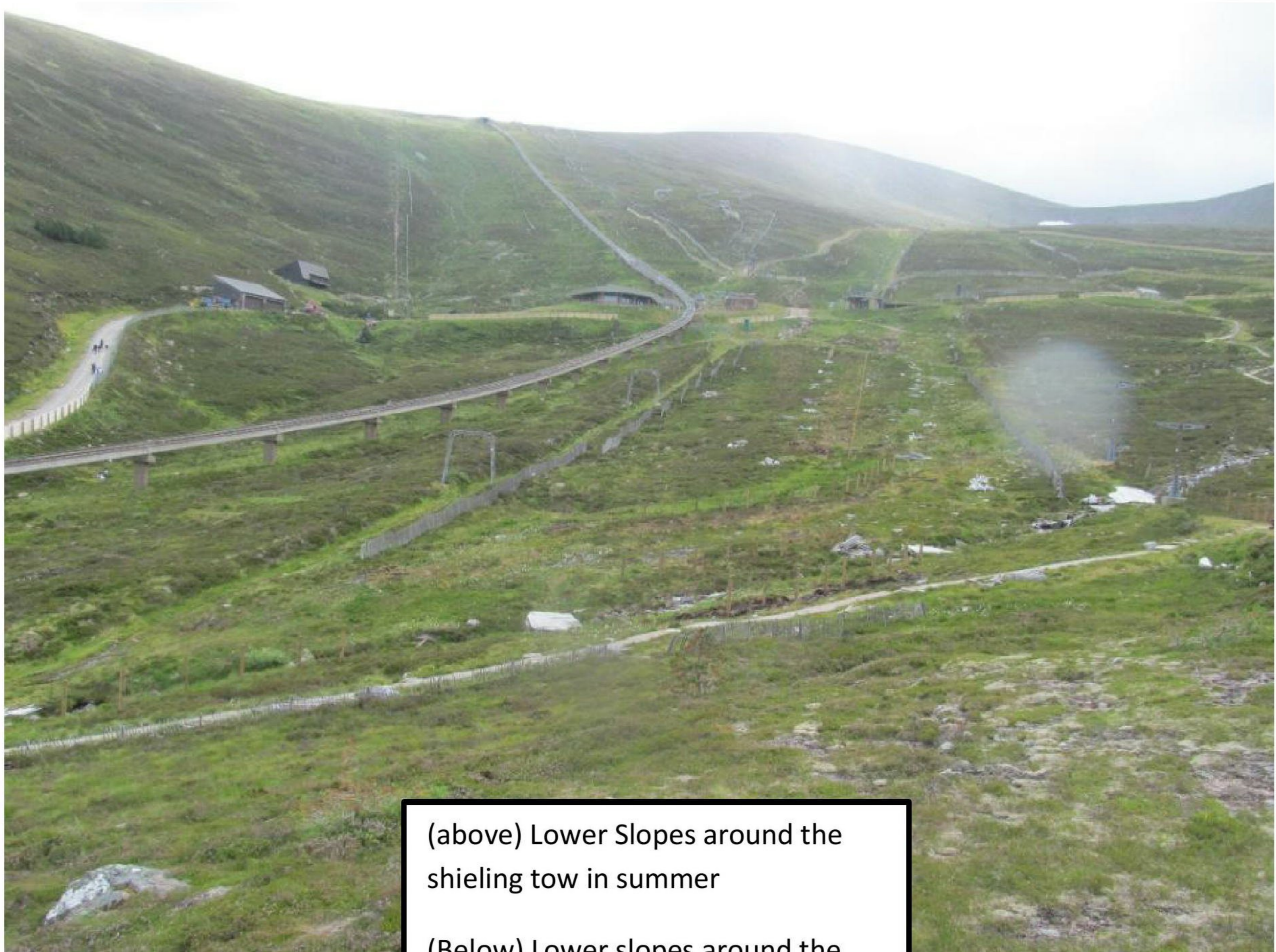
(above) Lower Slopes around the shieling tow in summer (Below) Lower slopes around the shieling tow with good snow cover