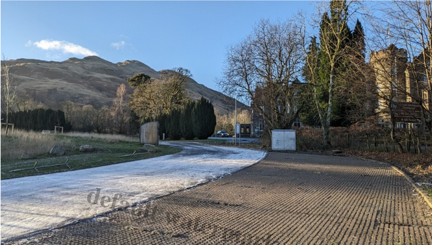
Part of the lower car parking area January 2026

Back in 2022-23 the LLTNPA had considered creating 'aires' for campervans and motorhomes as exist all over Europe ( see here ). Their site at Tarbet, with lots of space for parking large vehicles and reasonable facilities, would have been the ideal place to initiate this. Instead, the LLTNPA decided to restrict the numbers of campervans and motorhomes to a minimum and redirect them to other places with less good facilities.