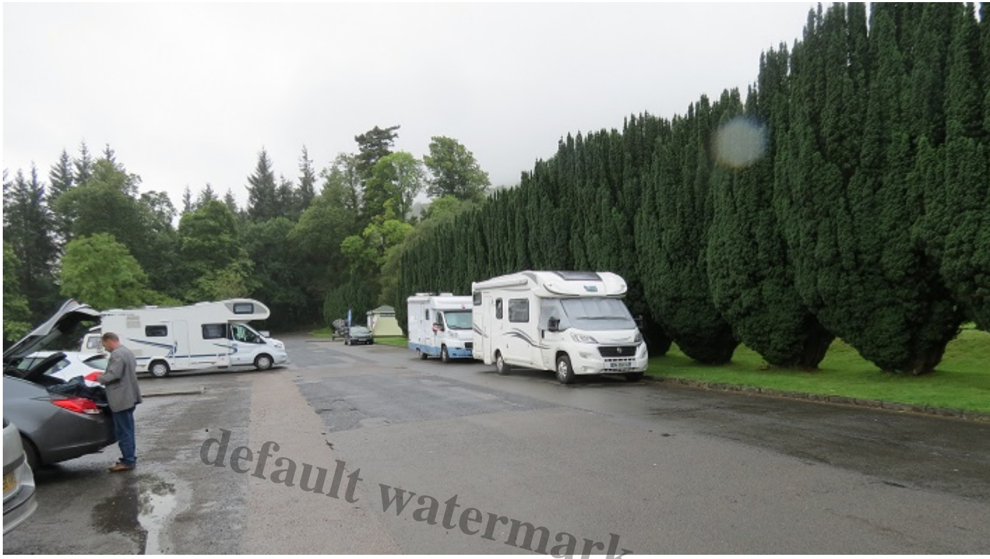
Motorhomes in the Tarbet car park at 08.52 am on 14th August 2016 – prime holiday season and plenty of space

It all then started to go wrong. In 2022 the LLTNPA announced (see here) – Improved motorhome facilities including better parking and waste disposal. The LLTNPA’s initial plan for revamping the car park, however, ignored the potential to improve infrastructure for outdoor recreation and provided just four places for campervans/motorhomes (see here) . Provision was then halved to two bays and the waste disposal point then moved from its ‘drive by’ location to one where motorhomes had to reverse either in or out – as show by the first photo.