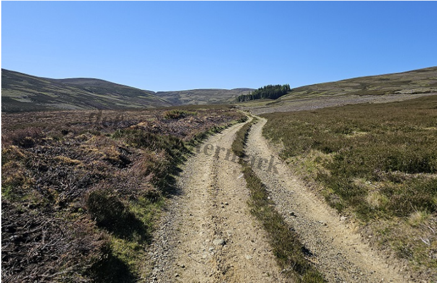
Recent muirburn (within last few months) at side of track from Corgarff to Brown Cow Hill on the Delnadamph Estate. Note the burned gorse.

Following my post on King Charles and the muirburn which took place on his estate at Delnadamph on 27th February, a very windy day ( see here ), I submitted a Freedom of Information request to the Scottish Fire and Rescue Service (SFRS) to see if their control centre at Dundee had been notified, as per the provisions of Muirburn Code. They replied on 31st March: