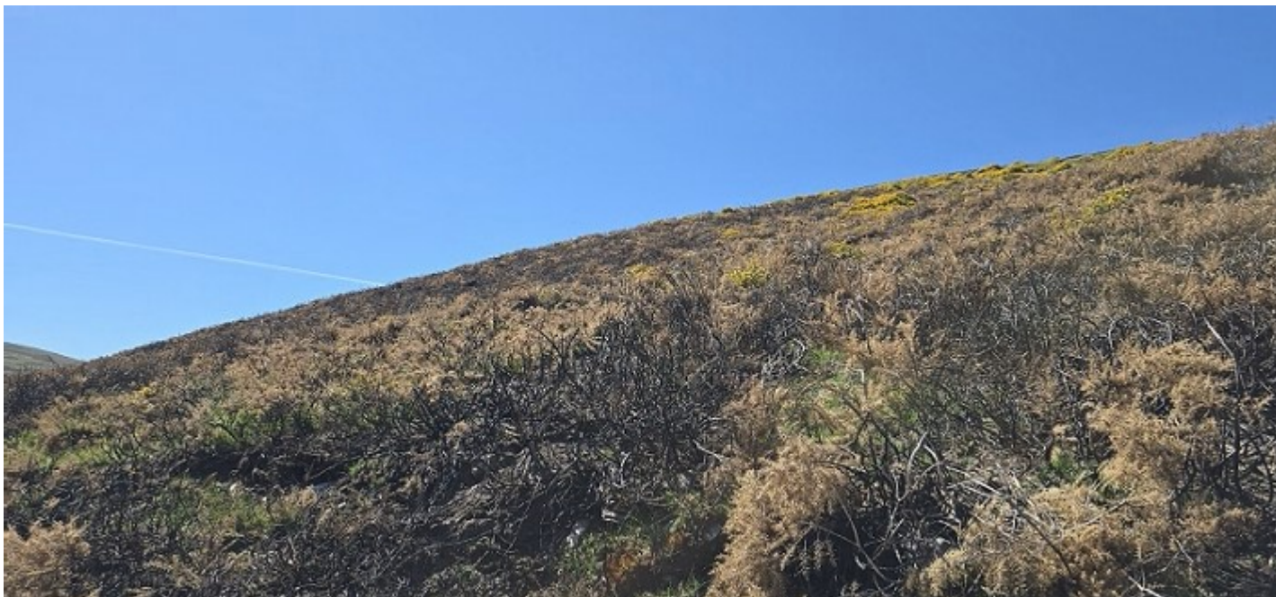
More burned gorse and heather Delnadamph May 2025.

What this tells you is that some estates are notifying the SFRS, as per the Muirburn Code, but not Delnadamph owned by the King. It is no wonder voluntary measures to improve land management don't work if King Charles ignores them. Where the royals lead, others follow.