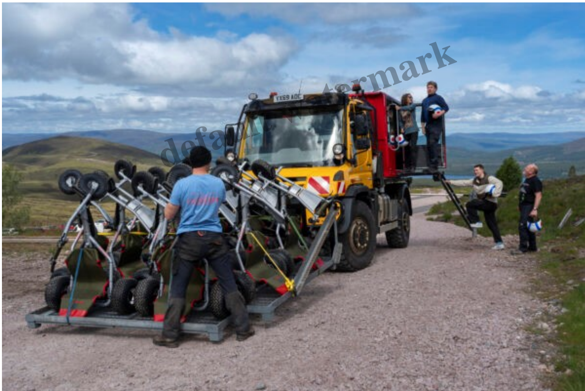
The cabin on the back of the Unimog which has been used to carry go-karts.

Last season after the CEO herself declared that the funicular would be running some devotees of snowsports at Cairn Gorm bought season passes on that basis.