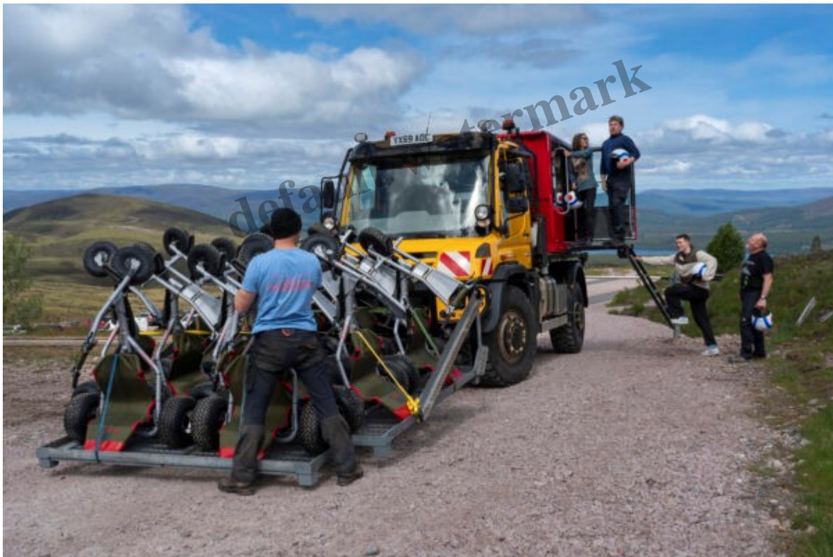
The cabin on the back of the Unimog which has been used to carry go-karts.

Last season after the CEO herself declared that the funicular would be running some devotees of snowsports at Cairn Gorm bought season passes on that basis.