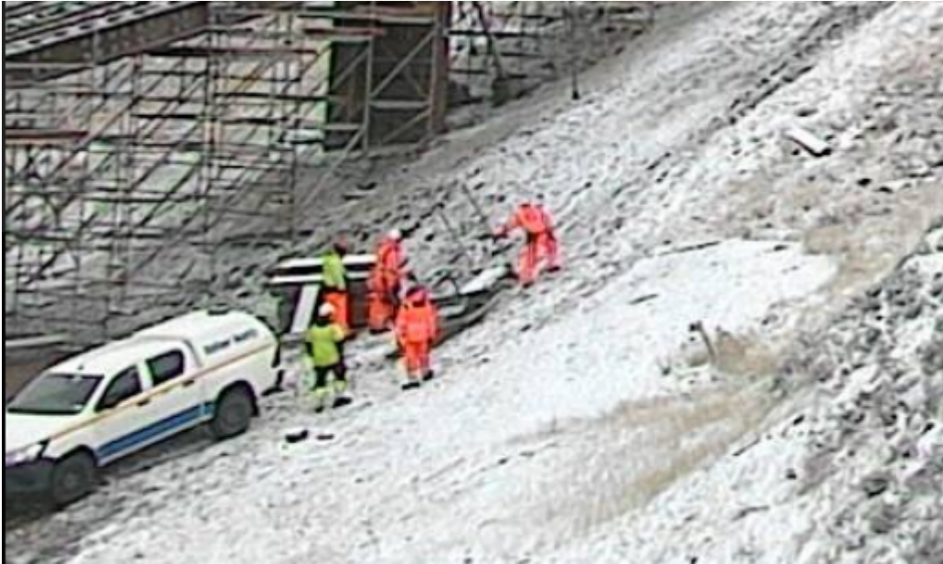
Photo 13th October – contractors appear to be working in all conditions to finish the repairs

We had the opportunity to speak to workers on the lower section of the track. Asked about a timescale for re-opening we were told that the work would be completed within five weeks. Talk in the Day Lodge café was of the same timescale as positions for funicular operators were being advertised with a starting date in five weeks time. The implication from these conversations is that staff have been told the funicular would be open for the start of the ski season.