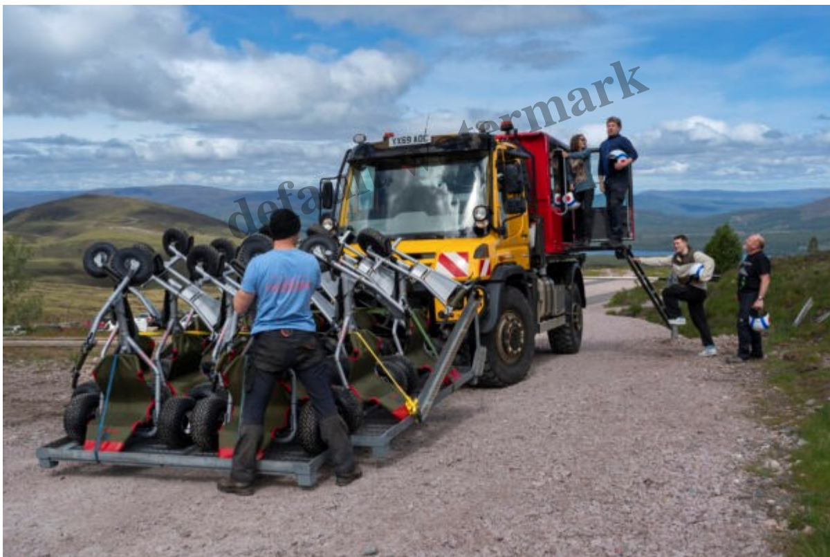
The cabin on the back of the Unimog which has been used to carry go-karts.

Last season after the CEO herself declared that the funicular would be running some devotees of snowsports at Cairn Gorm bought season passes on that basis.