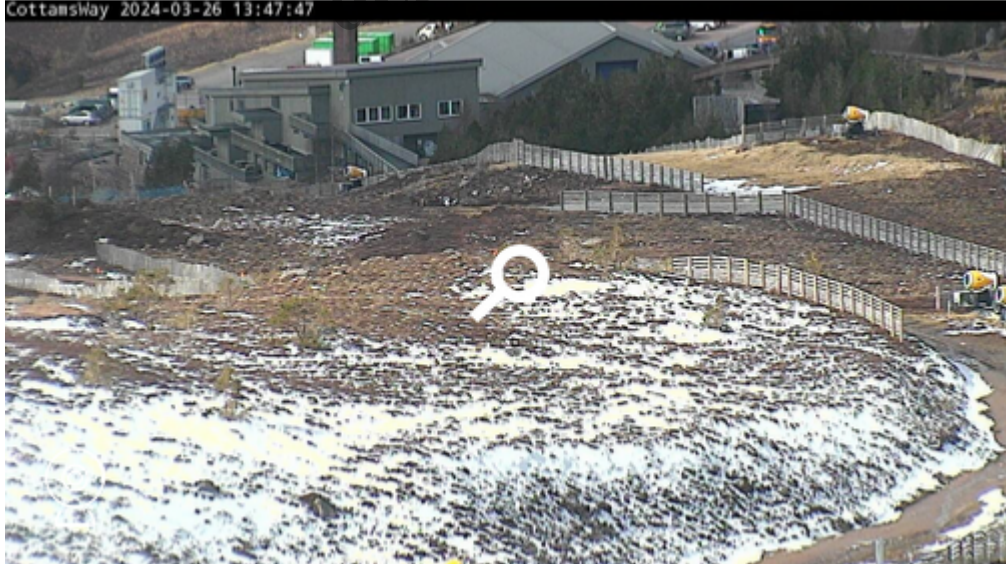
There is a seventh snow cannon near the Poma's lifts hut which can't be seen in the screenshot because of the poor visibility

Highlands and Islands Enterprise (HIE) funded the purchase of 13 snow cannon to assist the business's operation when the funicular was declared unsafe to operate. As far as I am aware they are all in working order, and yet while there are now perfect conditions for snow-making on Cairn Gorm AND there is a holiday period coming up, the workforce who should be doing everything they can to make this period economically successful have been sent home. The reason is the management team