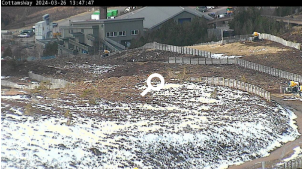
There is a seventh snow cannon near the Poma's lifties hut which can't be seen in the screenshot because of the poor visibility

Highlands and Islands Enterprise (HIE) funded the purchase of 13 snow cannon to assist the business's operation when the funicular was declared unsafe to operate. As far as I am aware they are all in working order, and yet while there are now perfect conditions for snow-making on Cairn Gorm AND there is a holiday period coming up, the workforce who should be doing everything they can to make this period economically successful have been sent home. The reason is the management team