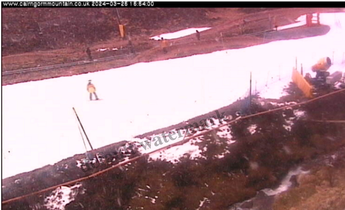
Lone snowboarder on beginner's area Monday with three people visible on magic carpet behind

On the evening of 28th February, HIE's fully owned subsidiary Cairngorm Mountain Scotland Ltd (CMSL) announced it was moving to a five day week and would not be operating on Tuesdays and Wednesdays. This decision was met with disbelief by snowsports enthusiasts, particularly those who had bought season tickets, but also affected CMSL's ability to make proper use of its snowmaking equipment and in the warm period before last weekend the beginner's area by the Day Lodge looked as though it might disappear completely. Just in time, temperatures dropped on Friday with a cold week forecast before Easter.