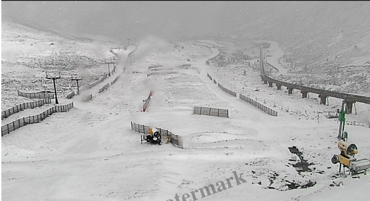
View from near Shieling with the sunkid rope tow, installed to provide a beginners slope, on the right (green)