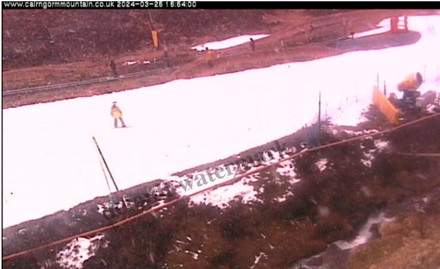
Lone snowboarder on beginner's area Monday with three people visible on magic carpet behind

On the evening of 28th February, HIE's fully owned subsidiary Cairngorm Mountain Scotland Ltd (CMSL) announced it was moving to a five day week and would not be operating on Tuesdays and Wednesdays. This decision was met with disbelief by snowsports enthusiasts, particularly those who had bought season tickets, but also affected CMSL's ability to make proper use of its snowmaking equipment and in the warm period before last weekend the beginner's area by the Day Lodge looked as though it might disappear completely. Just in time, temperatures dropped on Friday with a cold week forecast before Easter.