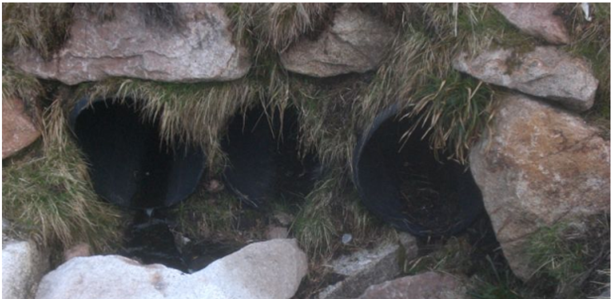
The new drainage pipes under the beginners area.

The pictures are of the beginner area approved by the Cairngorms National Park Authority (CNPA) planning committee in September 2020 and constructed thereafter. The first shows water flowing down the slope surface with the second showing the new drainage pipes which replaced the natural drainage channels that used to exist. Note how there is only a trickle of water out of one of the pipes (on the left)