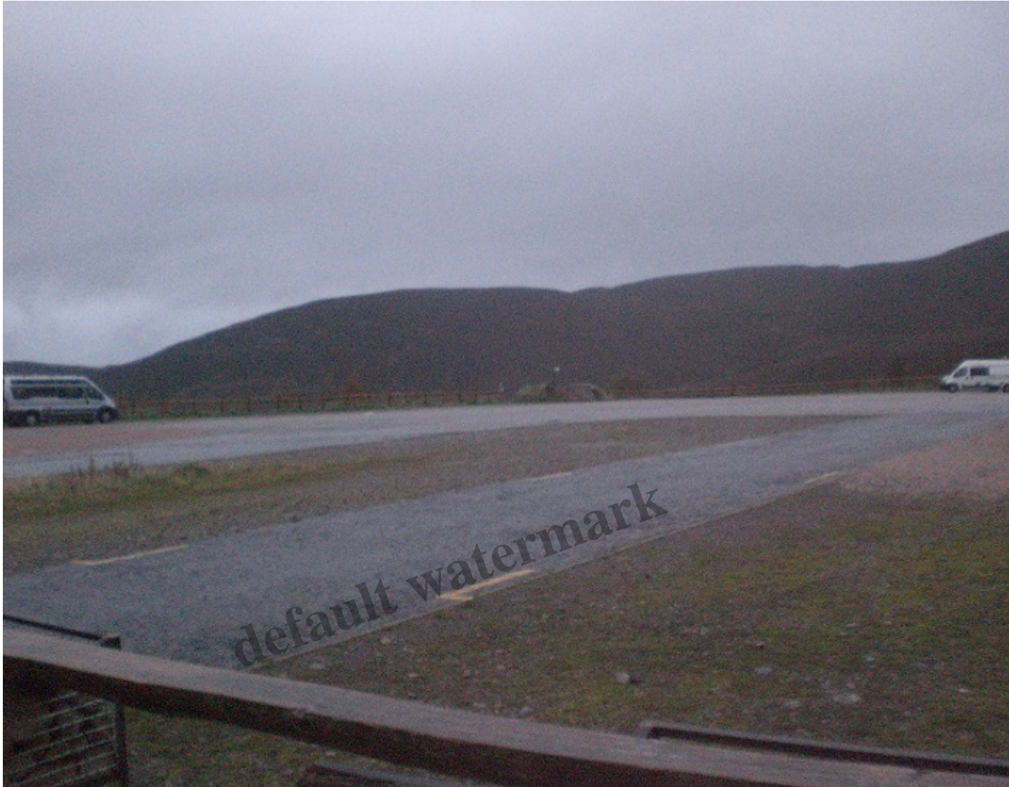
Ciste campervan park 11th October. There were two campervans compared to three in the Cas car park and four on the downroad.

What HIE doesn't appear to have appreciated yet is how information circulates around the campervanning world and unless they publicise the changes, they are unlikely to see increased bookings before the park closes for the "season" in two weeks time. Reducing the fees further – £5 is generally regarded as a fair charge for waste disposal – might help.