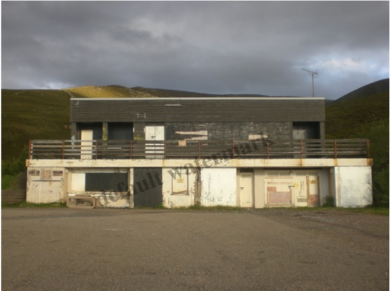
The Ciste building in June 2020

The Ciste building is a derelict eyesore and should be removed. Highlands and Islands Enterprise (HIE) own the land and building and it is therefore their responsibility to take the necessary action.