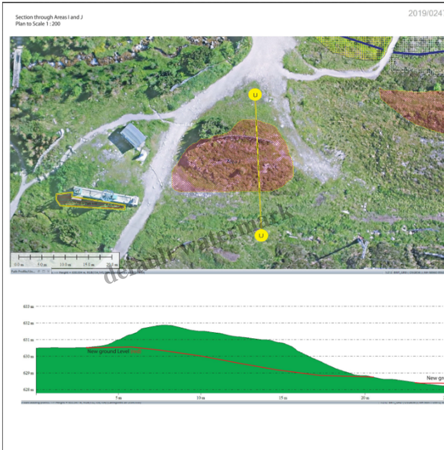
Example of ground smoothing from plans showing extent of work

The response from SNH, which can be viewed on the CNPA planning page, was that they had no objection, a stance which I have asked them and their head office to re-consider on the grounds that it undermines the CNPA's position.