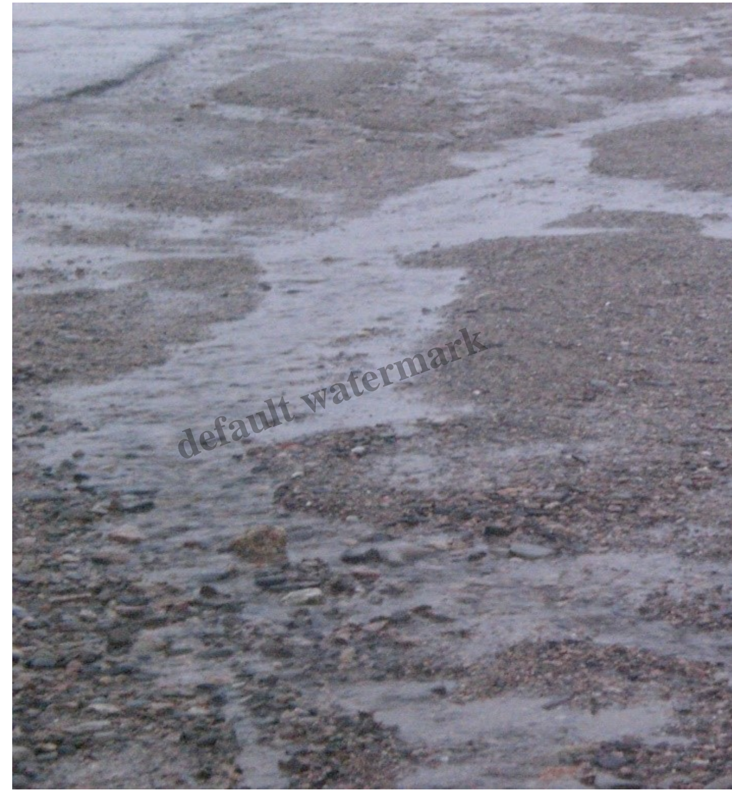
Almost a full-sized burn here with considerable erosion.....not fit to be used for parking. Photo Cred