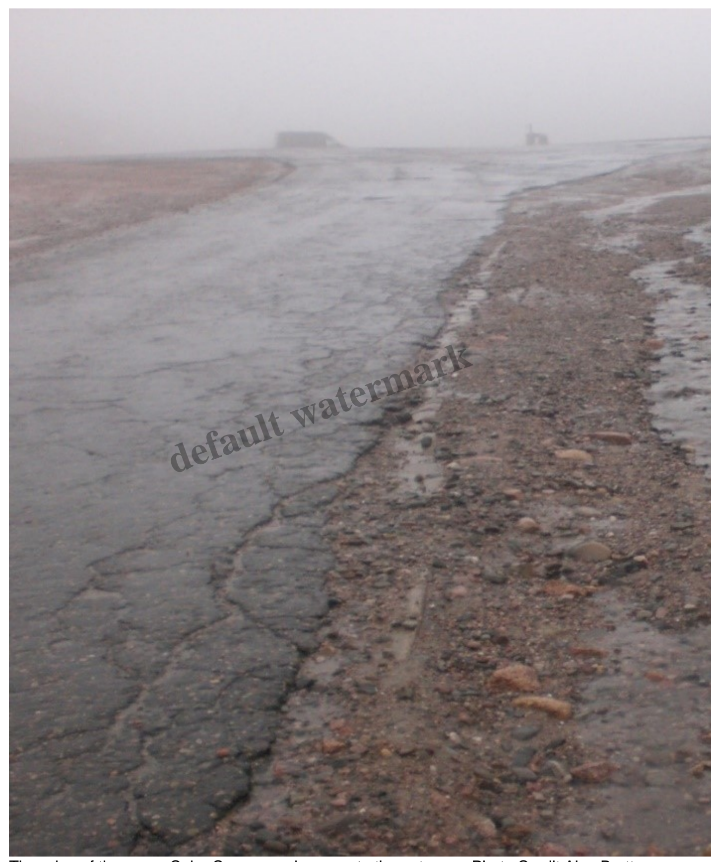
The edge of the upper Coire Cas car park nearer to the entrance.