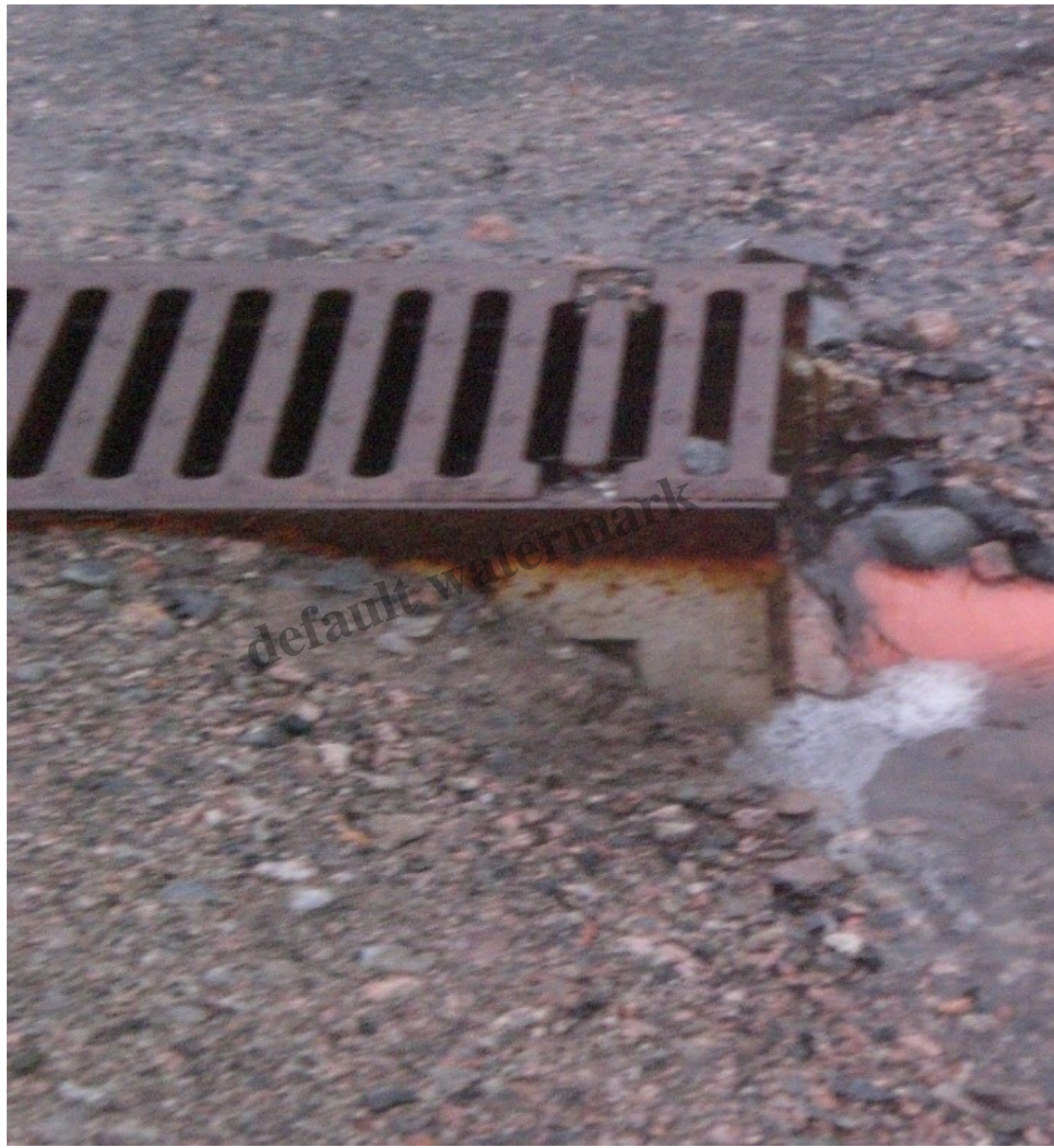
A broken/choked drain at the top of the car park. Photo Credit Alan Brattey

Visitors are met with clear signs of decay and dilapidation as they approach the Daylodge. Photo Cre