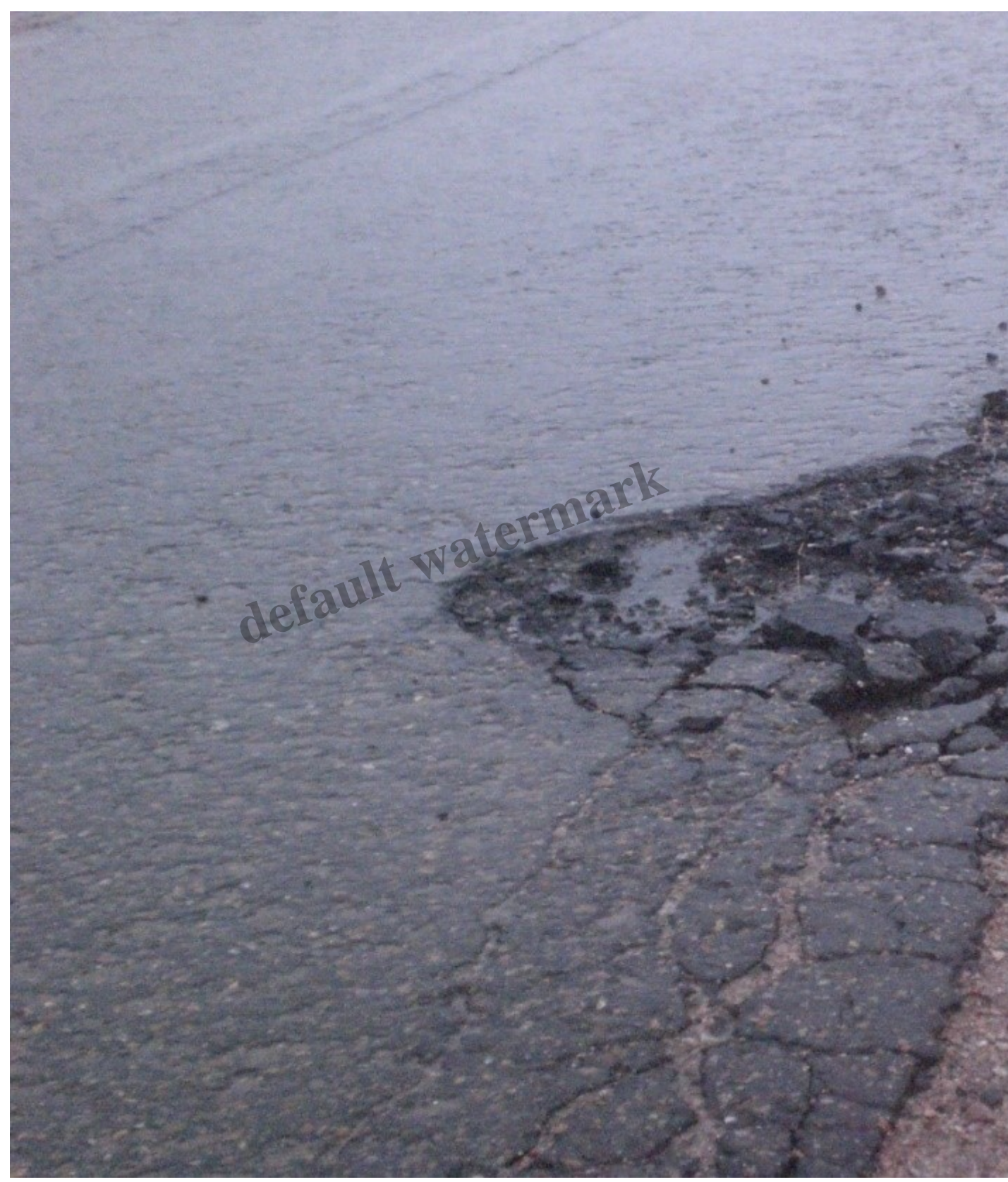
The roadway itself is crumbling away.

No drains to collect the rainwater so it flows downhill gathering volume and causing unnecessary da