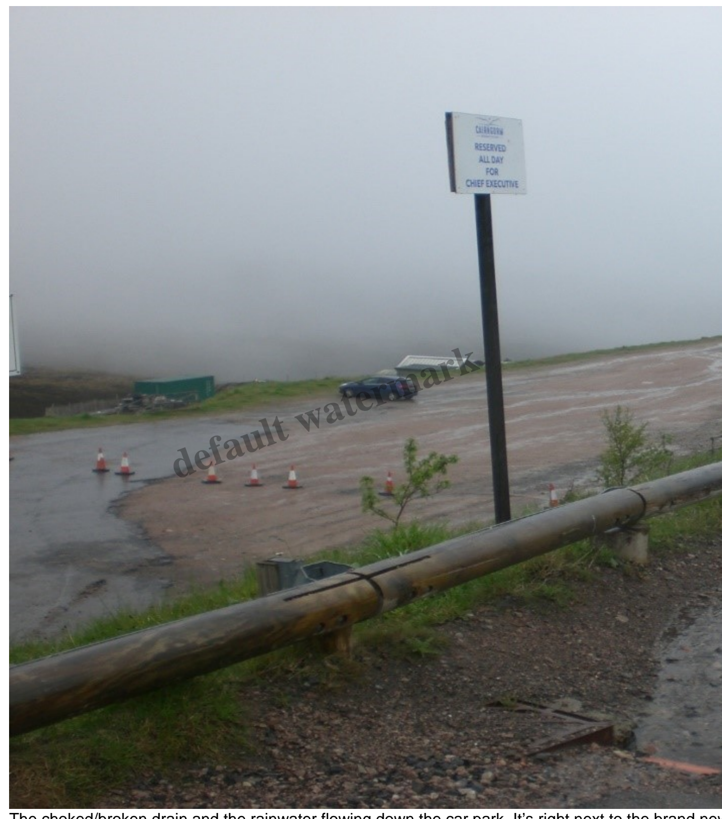
The choked/broken drain and the rainwater flowing down the car park. It's right next to the brand next