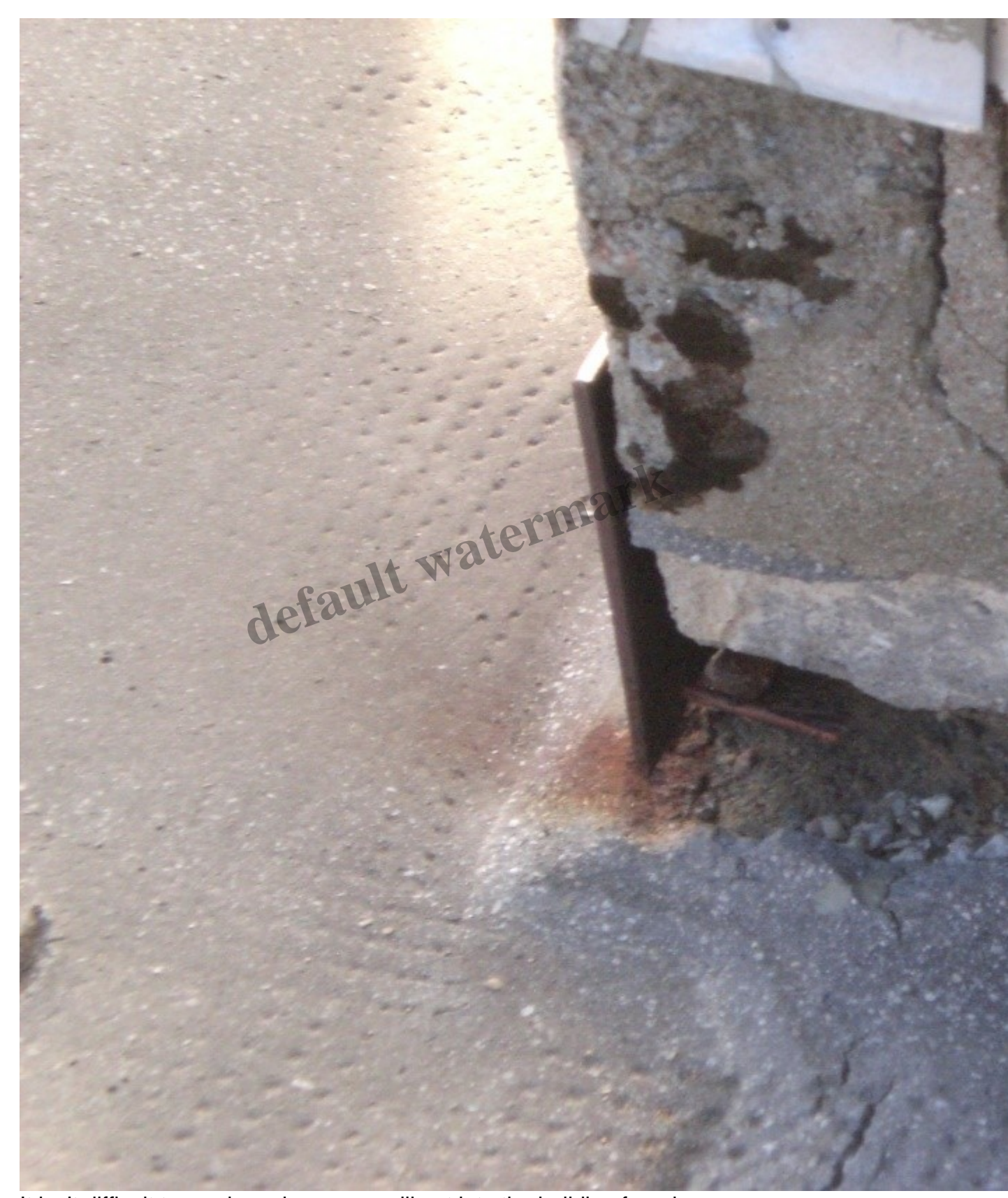
It isn't difficult to see how dampness will get into the building from here.