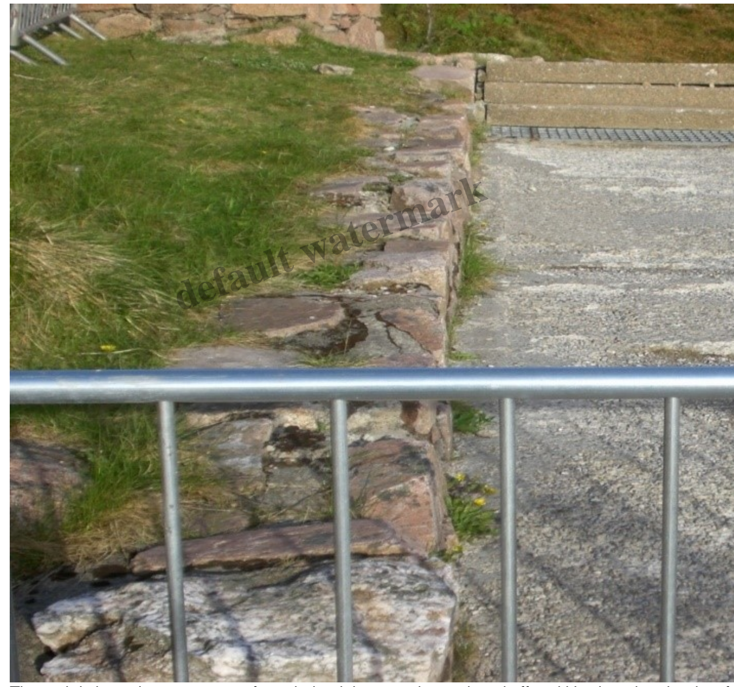
The path is in such a poor state of repair that it has now been closed off and it's clear that the dwarf

Following the disabled access path around the building leads to further dilapidation