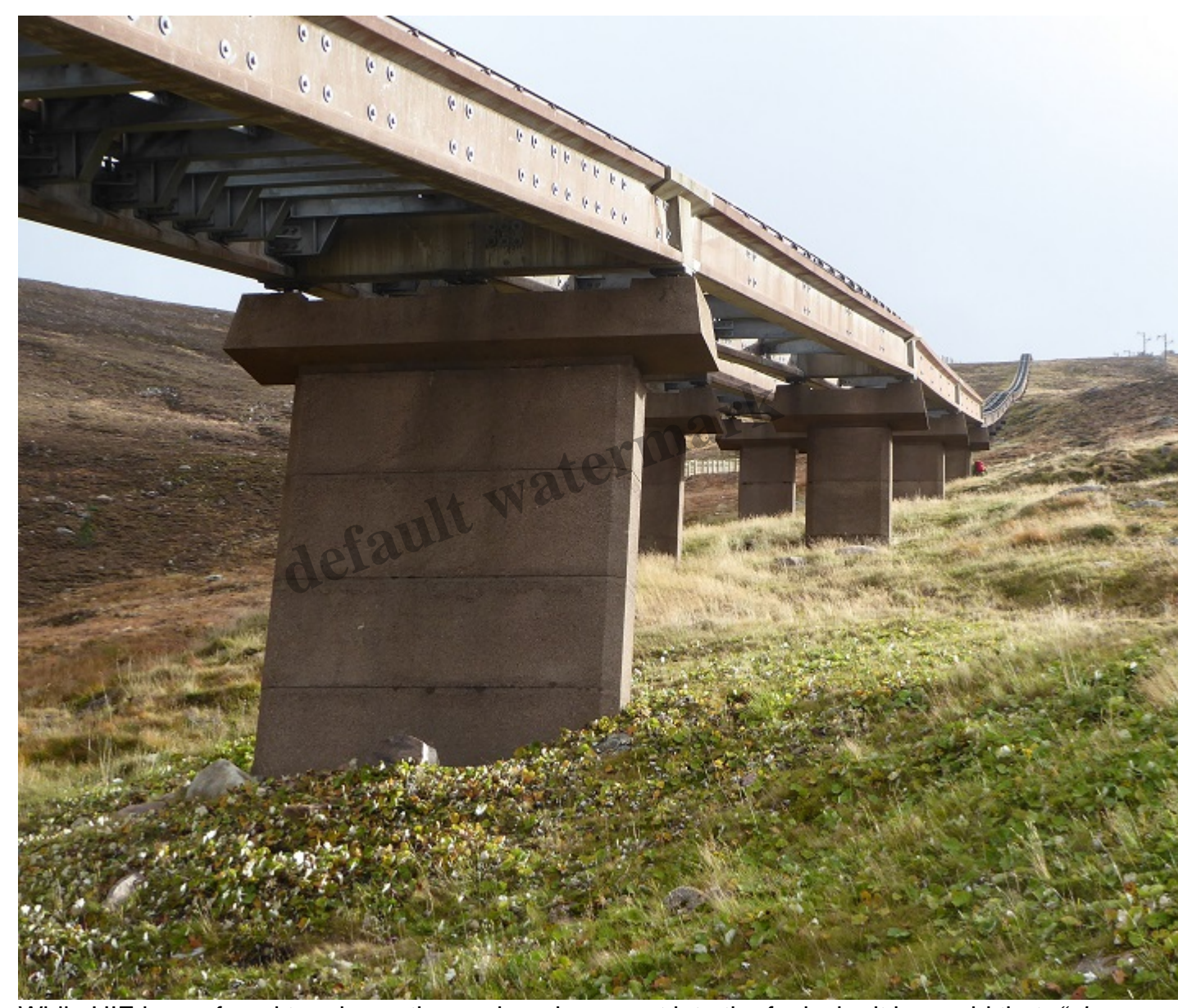
While HIE has refused to release the engineering report into the funicular it has said that "piers need strengthened and realigned, beams need strengthening, and all bearings need replaced on the piers

Highlands and Islands Enterprise, as owners and custodians of the Cairn Gorm Estate, have full responsibility for the maintenance and upkeep of the public assets that lie within the estate.