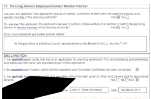
Extract from Application Form as it currently appears on Park portal

I was even more surprised to see both forms were dated 3rd March 2017.