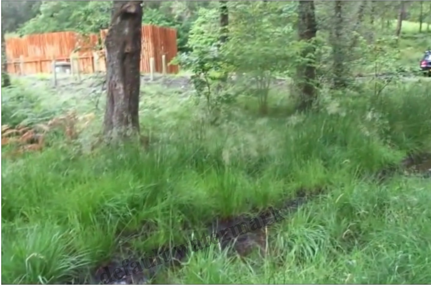
Water course running down beside pitch 8 feeding into pitch 10