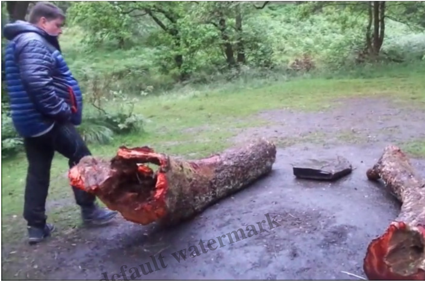
New logs cut from tree behind?