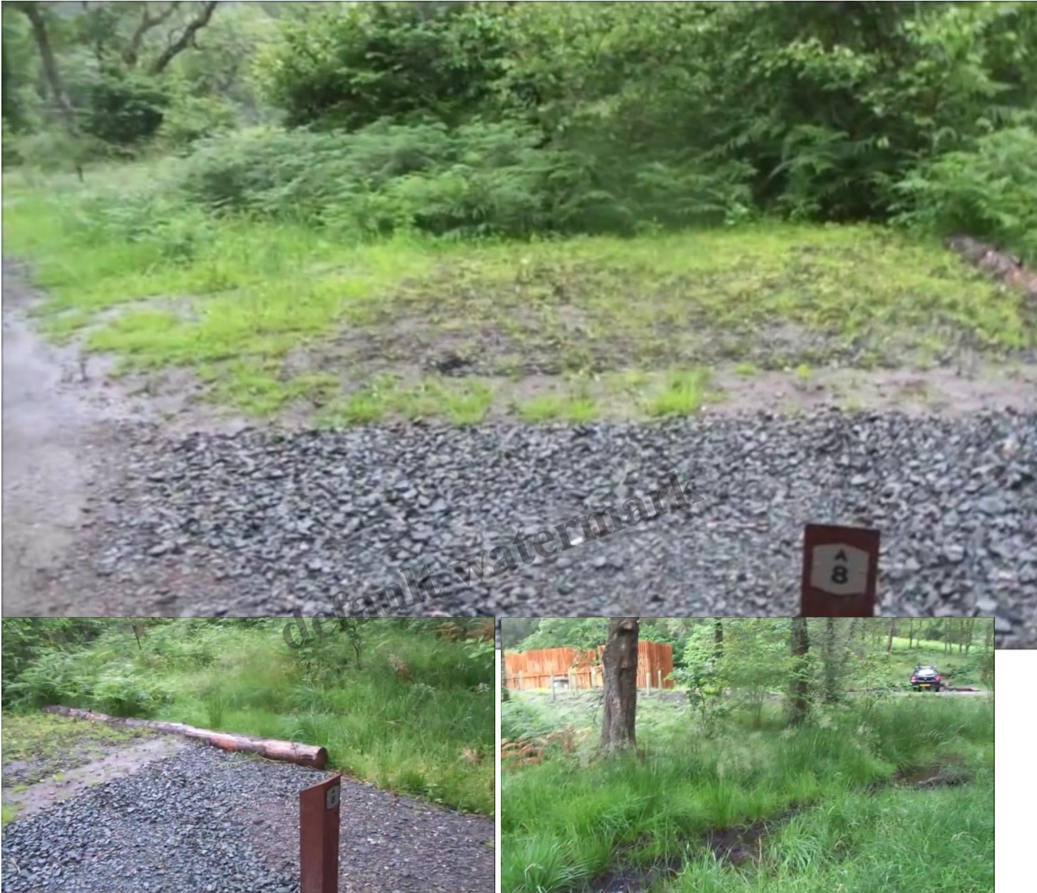
Pitch 9 – Video Counter10:30