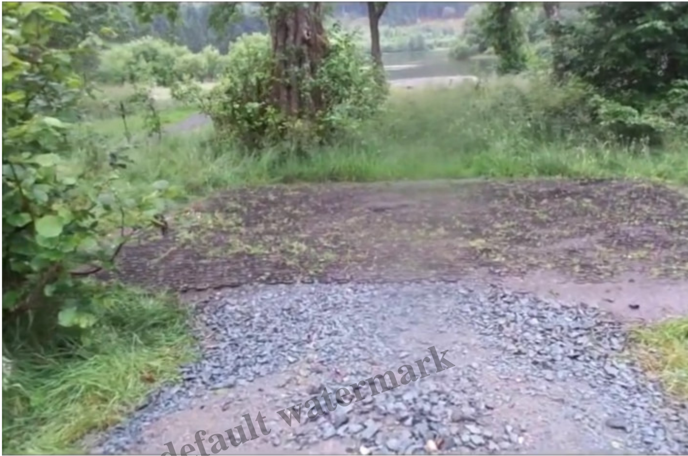
Entrance to disabled pitch 9 "But look, would you really want to camp on that"