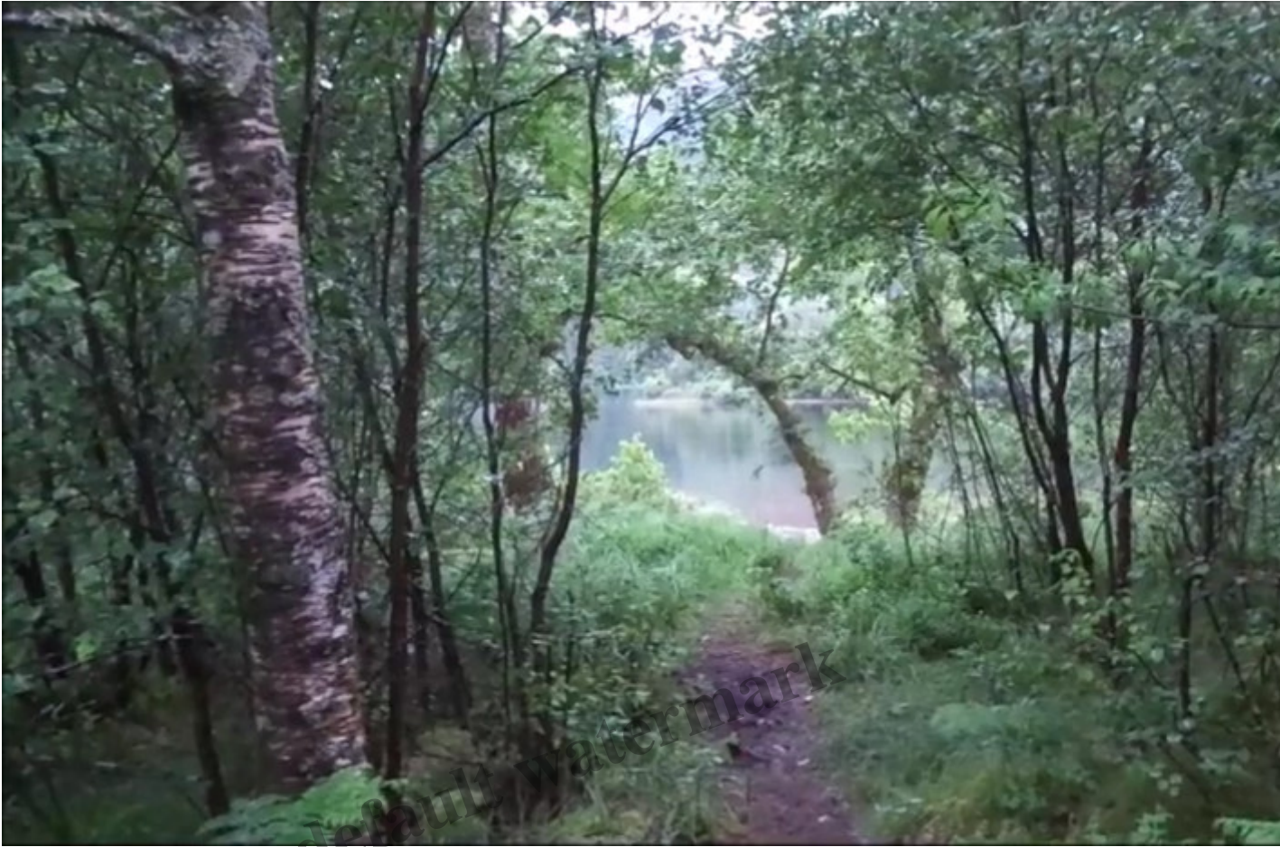
Nice and close to the loch with path directly from pitch.