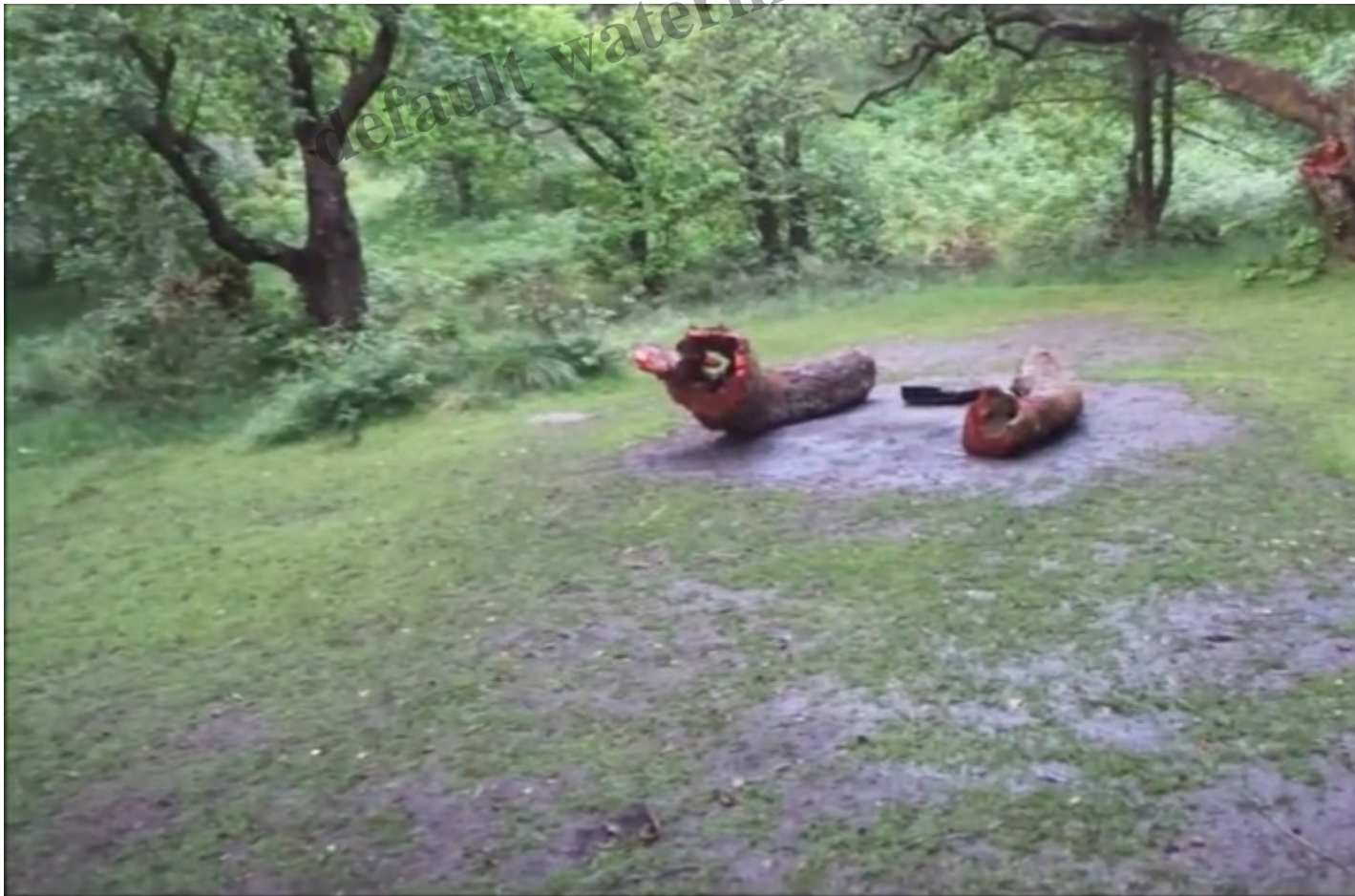
Pitch 21, the best pitch on the site, original loch shore location and holds 2 tents

Mechelle goes onto describe other site attributes at the start of the video, and visits pitch 21, the jewel in the crown, representing what park users expect from camping pitches in the park and what the National Park Authority should be delivering as their world class visitor experience.