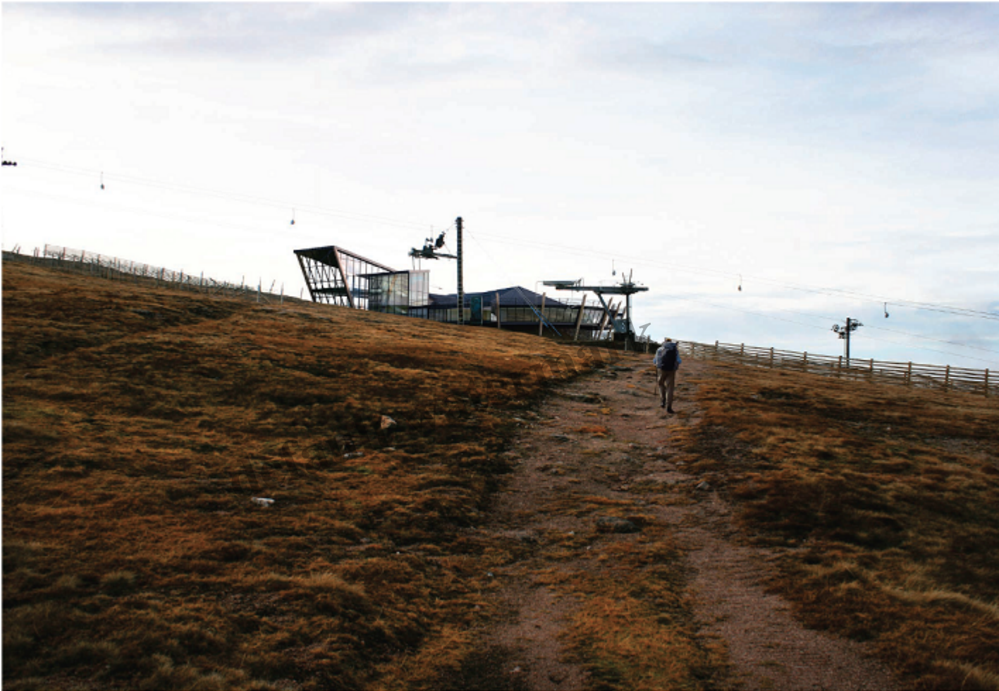
Photomontage of option 1 for Ptarmigan contained in undated Cairngorm Mountain; Pre-planning feasibility document

After Highlands and Enterprise announced a masterplan had been agreed for Cairngorm, without actually releasing any details of its proposals ( see here ), I asked for these under Freedom of Information. I was refused ( see here ) and on 24th April I submitted a formal review request as required under Freedom of Information procedures. Meantime, a number of other FOI requests were submitted to other Public Authorities about what information they held about the proposals for Cairngorm and the first response was from Scottish Natural Heritage (well done SNH!). Along with the response letter were over 20 MB of documents.