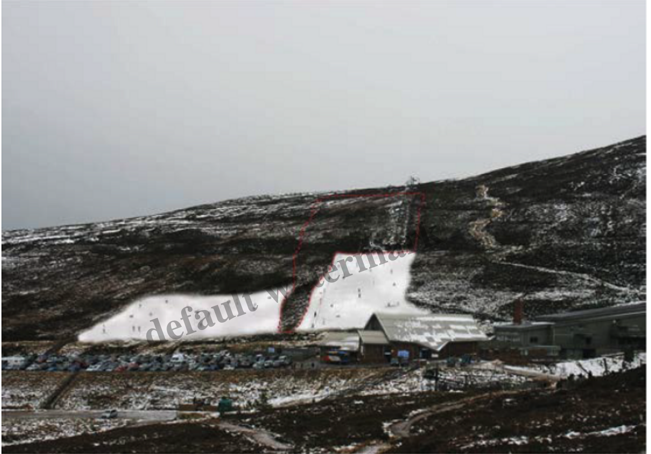
Cairngorm Mountain: pre-planning feasibility document