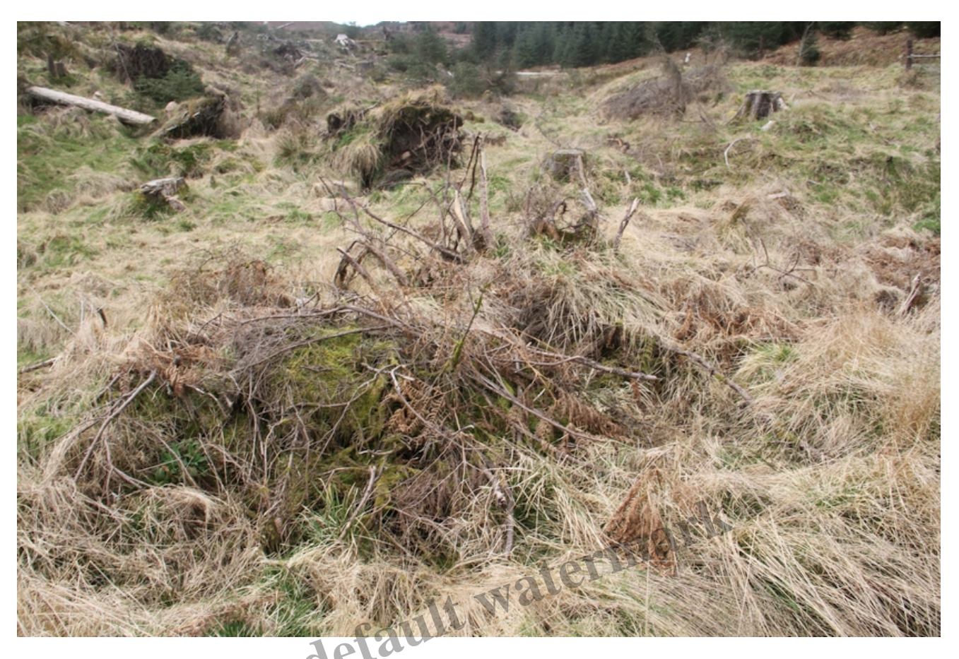
Looking from the far end of the zone towards the zone map post (top right)

Zone D is yet another example of phantom camping provision from the LLTNPA and supposedly provides 2 camping pitches to replace those on the areas of our loch shores where campers are now banned. This area has zero amenity. There is no good reason to be here, let alone camp, it has no redeeming features and the presence of the stream holds only false promise. It is a thoroughly.unrewarding location.