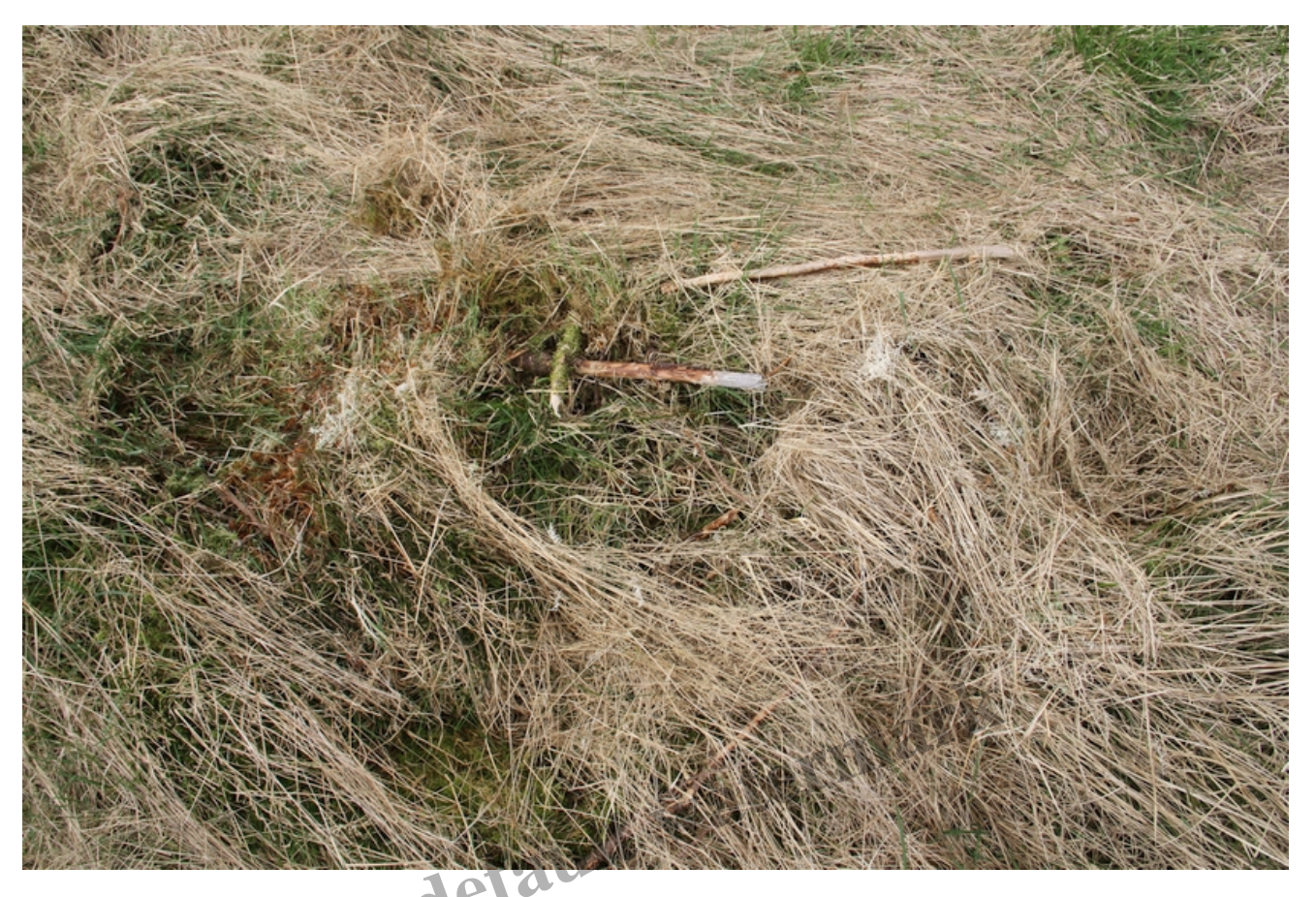
It's on rough grasses growing over previously felled wood and not suitable.