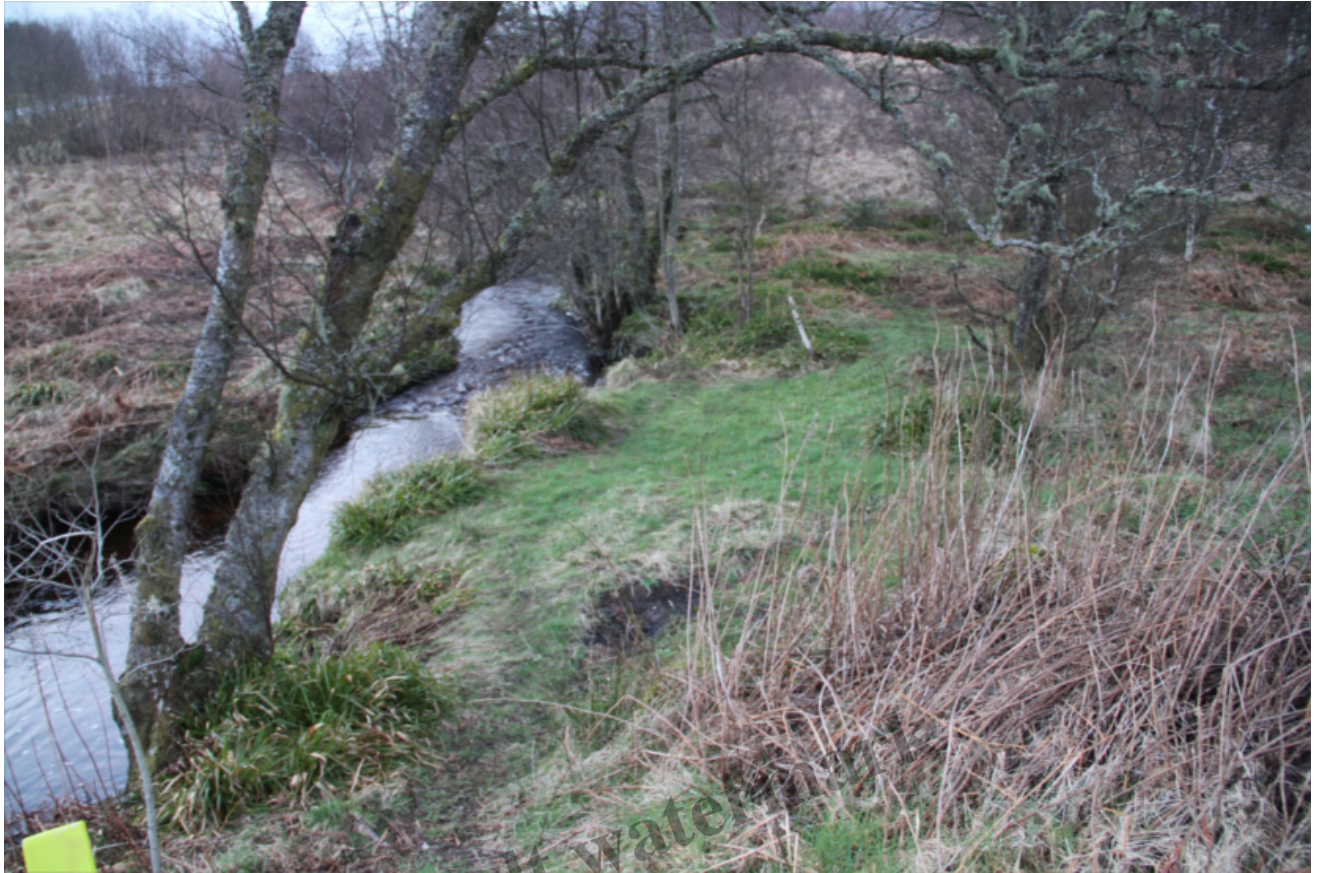
Pitch 1 Long and Narrow and suitable for a two/three person tent.