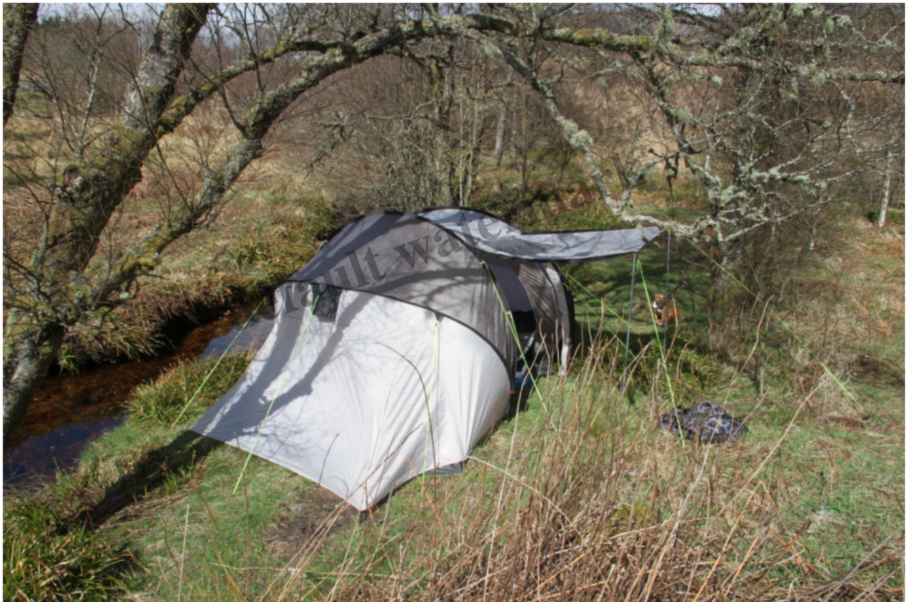
Pitching an 8 man tent on a 3 man pitch

The family of 5, 2 adults and 3 children, with a dog, had purchased a permit for Forest Drive zone 'M': a site suitable only for a three man tent in a location wholly unsuitable for a family camp. The LLTNPA's "Get a Permit site" misled them by not explaining the nature of the site or its capacity for tent size. The result is their 8 man tent had to be shoehorned into the only level space in the entire zone leaving them precariously close to an overhanging river bank.