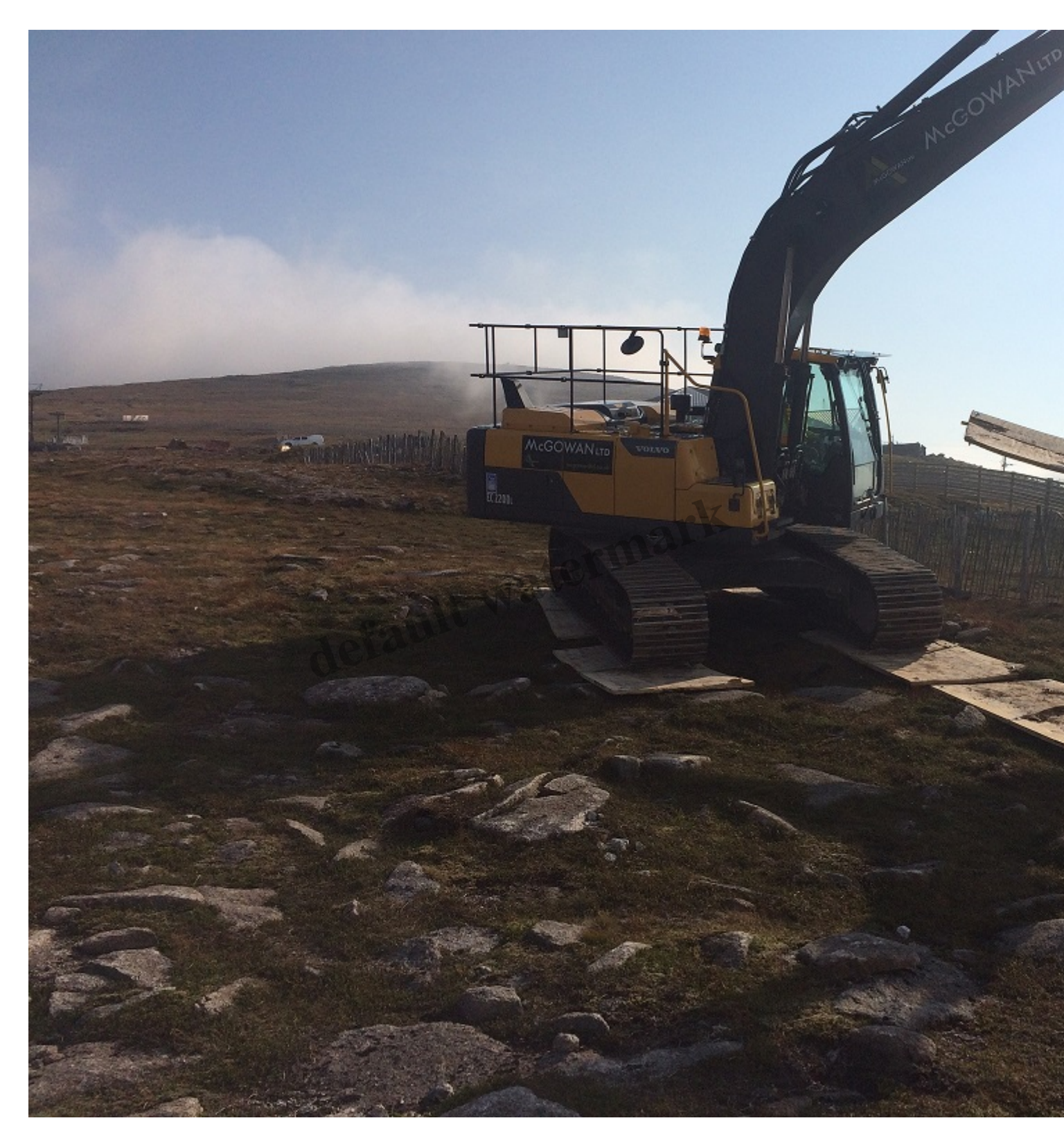
On 11th October Natural Retreats posted this photo on the behind the scenes section of the Cairngorm Mountain blog. The caption above it read:

The West Wall Poma project is progressing well, with the steel work installation scheduled to commence on Monday 17th of October. The picture below shows a 20 tonne excavator which has