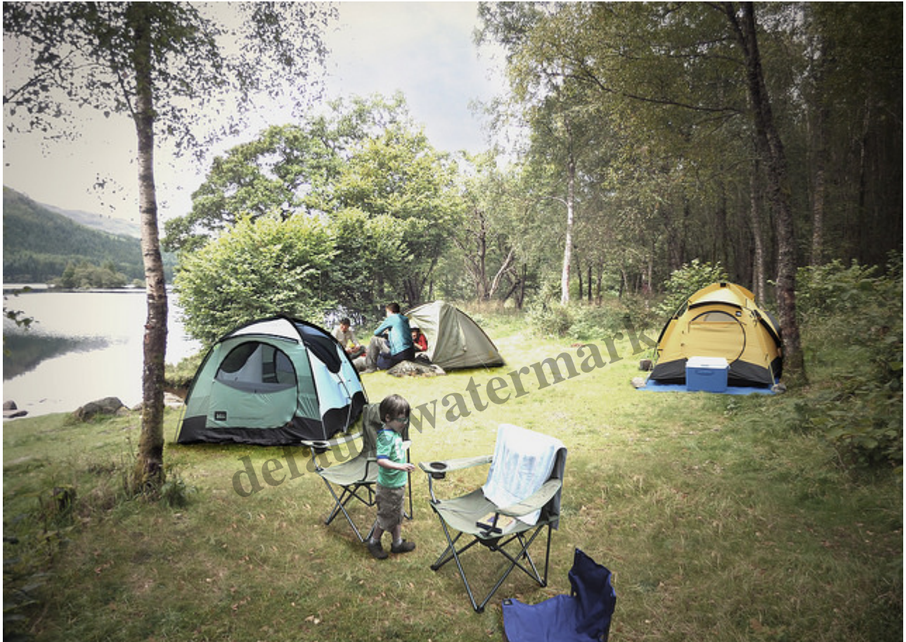
Artist's impression of improved camping at Loch Chon, in The Trossachs

“As part of the plans which will come into effect for the 2017 season, feasibility work is already well advanced at Loch Chon in The Trossachs on land managed by Forest Enterprise Scotland. It is proposed that the picturesque site at Loch Chon will accommodate 30 tent pitches alongside facilities including a fresh water supply, waste disposal and toilets. Similar sites will be created across the four management zones”. (LLTNPA Press Release 26/01/16 welcoming the Ministers approval of the camping byelaws).