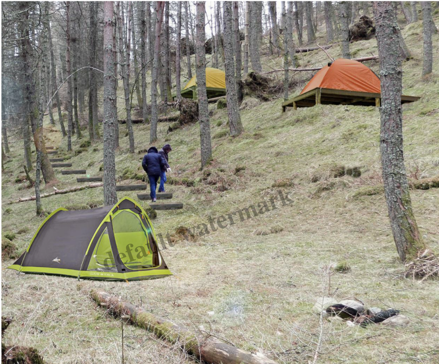
Illustrative campsite design submitted to Scottish Ministers as Appendix 4 to the bye-law proposals

fool most of the people most of the time – what the Park is actually planning includes wooden camping platforms on the hillside.